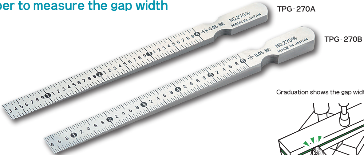
Graduation shows the gap width

Use the thickness of taper to measure the gap width