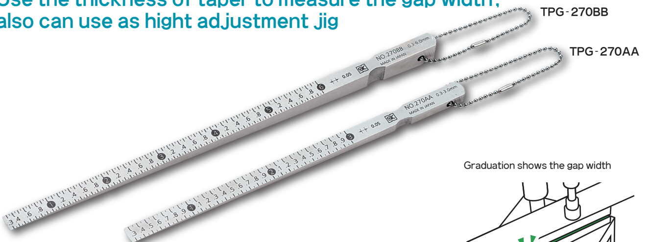
Graduation shows the gap width

Use the thickness of taper to measure the gap width, also can use as high adjustment jig